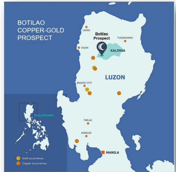
Location map of the Botilao Prospect in Northern Luzon, Philippines

The result of historical exploration works and the current understanding of the MCB Deposit will provide the initial working model for the Botilao Prospect.